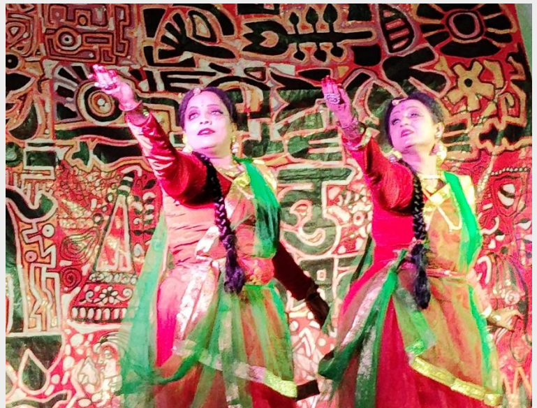
Rong Rasia – a dance performance by Trikal on 21 st Mar'25